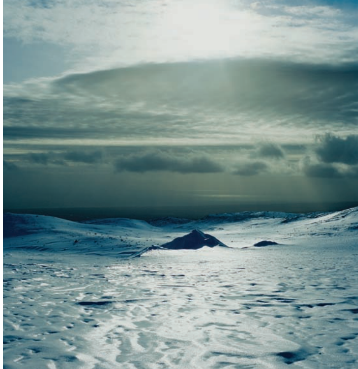
True North Series , 2004. Digital print on Epson Premium Photo Glossy paper, 100 × 100 cm (39.37 × 39.37 in).

Though the book is about gender and its connection to nationhood and the politics of imperialism and science, much of the interest generated