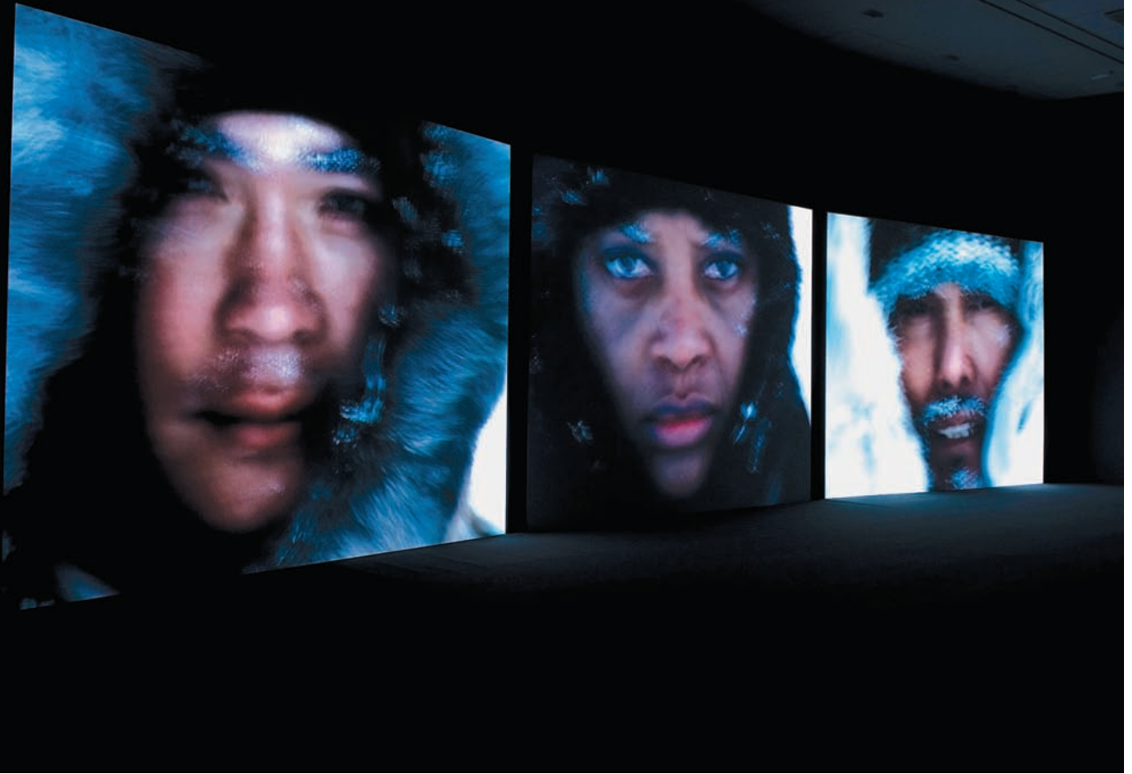
True North Series , 2004. Triptych of digital prints on Epson Premium Photo Glossy paper.

and masculinity across the national cultures of the United States and the United Kingdom. In what follows, I return to how these discourses are invoked and renarrativized in Julien's work.