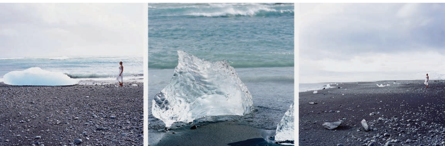
True North Series , 2004. Triptych of digital prints on Epson Premium Photo Glossy paper, each 100 × 100 cm (39.37 × 39.37 in).

earlier works but also their aesthetic drive — something that was critical to the exploration narratives of the heroic age. However, Julien's use of the aesthetic provides a very different approach, challenging some foundational assumptions of the sublime as overwhelming and humbling, since he offers us a vision of the Arctic that is not unmediated but highly technologized and artificial, as evidenced by his lush production values and his use of three screens rather than one. This technological beauty in the film is compelling in that it is used to draw out our fascinations with the North Pole and show how the drive to possess it was not simply about ownership or nationalism. His film emphasizes that the representation of polar exploration exceeds both purposeful activity and the instrumentality of the earlier colonial narrative of exploration, science, and discovery. However, he does not give up politics to focus on beauty. The two are presented as inextricably entangled with each other.