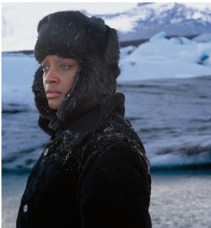
True North Series , 2004. Digital print on Epson Premium Photo Glossy paper, 100 × 100 cm (39.37 × 39.37 in).

These questions, in the context of my book, are meaningful in terms of the unacknowledged failure enacted not only at the North Pole, early in the twentieth century, but also late in the century — during the Vietnam War and, at the time of the book's writing, during the first Persian Gulf War. Gender on Ice has been my attempt to explain the interconnections between the multiple narratives of national identity, scientific progress, modernity,