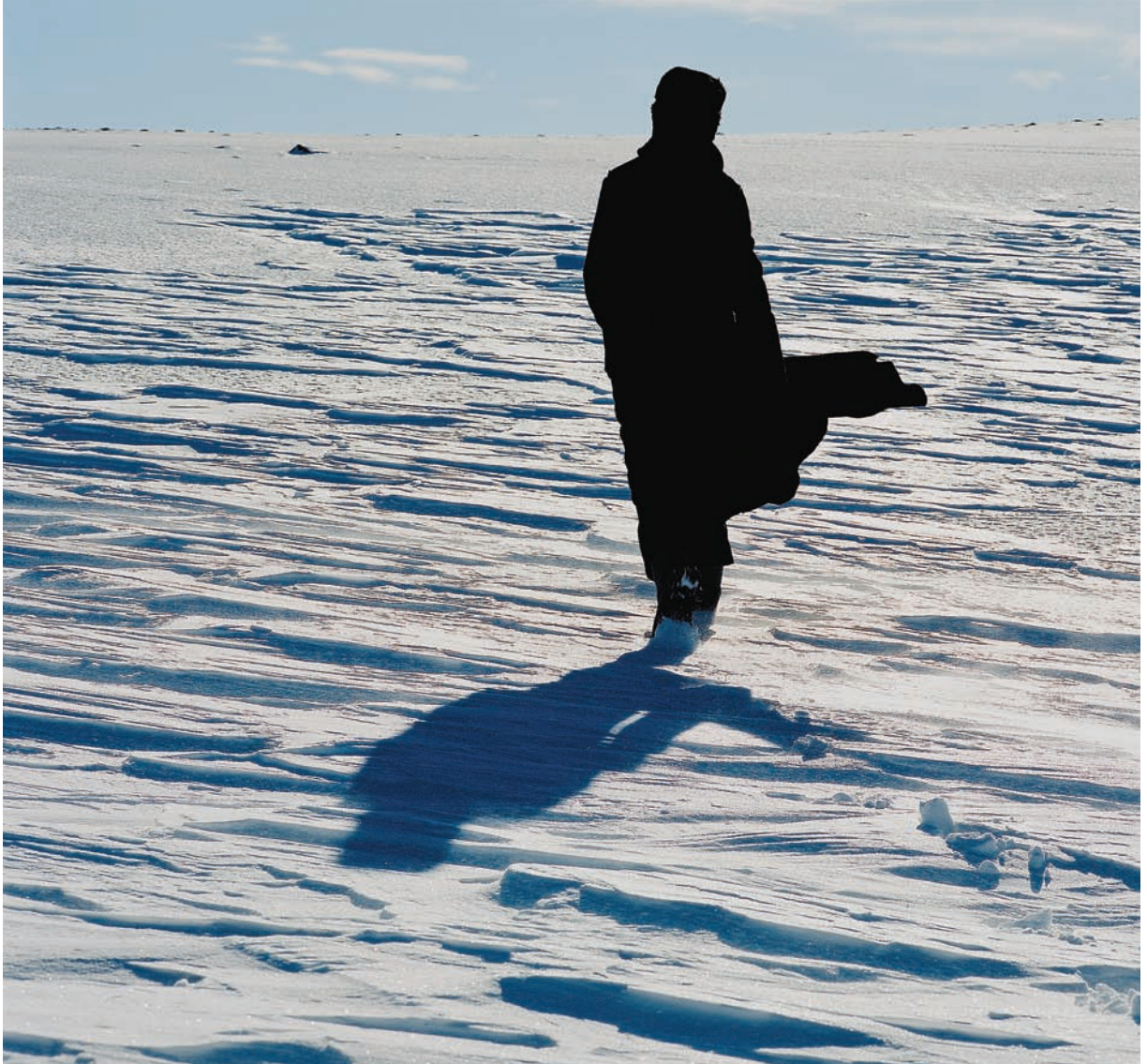
True North Series , 2004. Digital print on Epson Premium Photo Glossy paper, 100 × 100 cm (39.37 × 39.37 in). Courtesy the artist and Metro Pictures, New York

explorers by highlighting and ironizing the aesthetic side of exploration. This gets us away from a more straightforward critique of Peary and white scientific practices. Julien reminds us that scientific exploratory projects have an aesthetic dimension that may not be apparent in official accounts. Peary might see beauty for its own sake beyond his brutal so-called scientific practices, but Julien’s highly artificial and more ironic relationship to beauty is also a response to Peary’s older colonialist discourse of technology, which minimizes the significance of Henson and the Inuit workforce by representing them not as exploited workers but as “cogs” that are instrumental in the workings of what Peary termed his smooth and well-managed “traveling machine.”